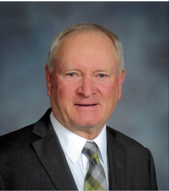
Mayor Rod Westbroek