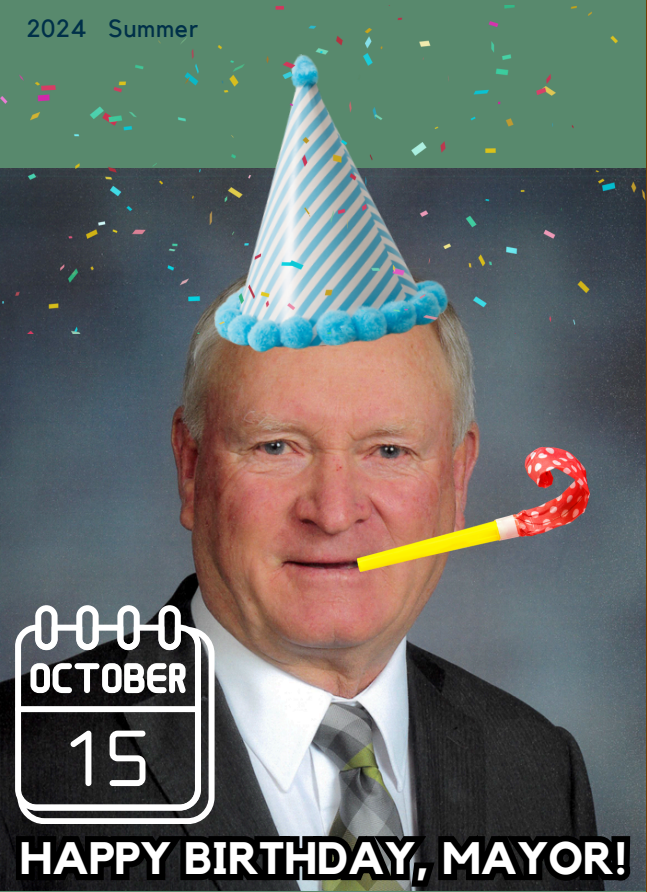
Mayor Rod Westbroek