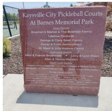
Wedge 30 inches X 44 inches X 12 inches