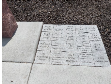
Cement slab 40 inches X 16 inches X 2.5 inches

Bronze level: $150 for each brick/$300 for a double brick