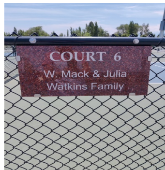
Court Sign 20 inches by 10 inches X 1 inch

Parsons for $85,000 in kind donation Aluminum Sign 4 feet by 5 feet