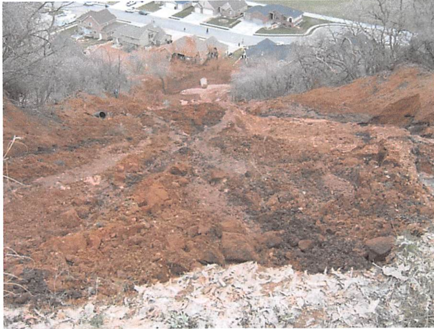
Figure 7. View looking down the landslide flow path at the damaged house at 1650 East 7687 South. The culvert in the lower slide path above the house was originally in the gravel pit. Subsequent water flow eroded the right side of the landslide.

broke through the house and garage walls and a small volume of sediment and tree debris was deposited in the house. A child inside the house was injured and the landslide impacted with sufficient force to break part of the house foundation wall (figure 8). The impact to the back of the garage pushed a car and pickup out through the garage doors. The landslide broke windows at the adjacent house to the southwest at 1650 East 7701 South. The landslide also damaged the Davis-Weber Canal which had recently been enclosed in a concrete box culvert but was not yet covered with backfill (Ray, 2006) (figure 9). Water had not yet been turned into the canal for the irrigation season so obstruction to flow in the canal by the landslide was not an issue.