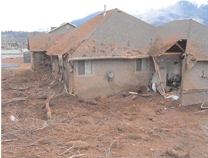
Figure 4. Damage to the house and garage at 1650 East 7687 South.