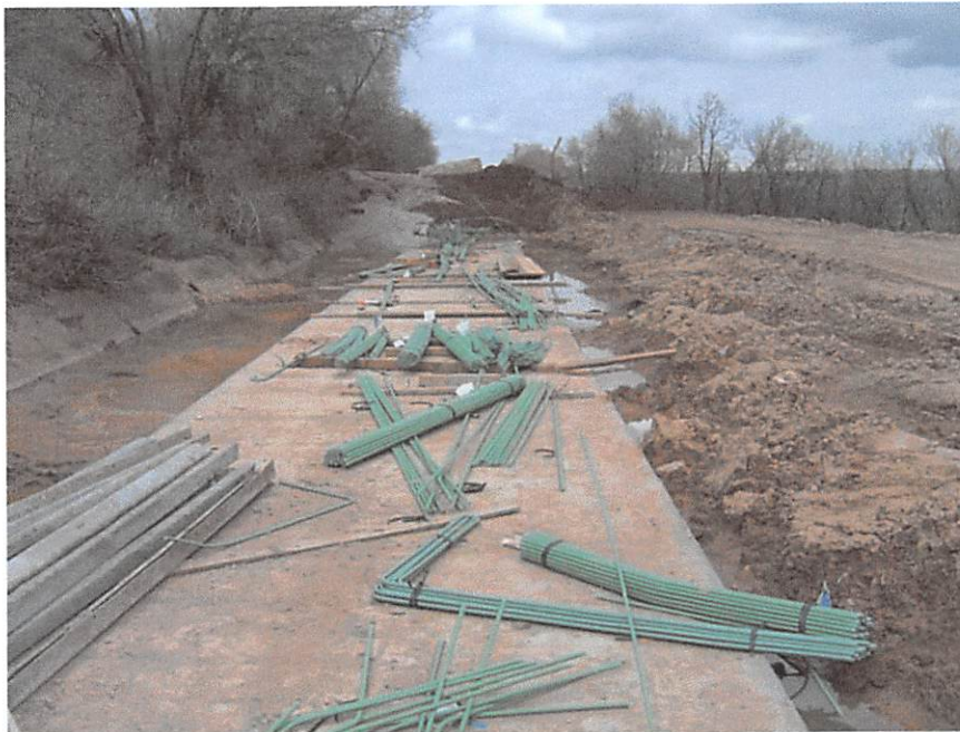
Figure 9. View looking northwest of Davis-Weber Canal showing landslide material deposited on the box culvert and canal access road. Following the landslide water and sediment flowed into the canal left of the box culvert.