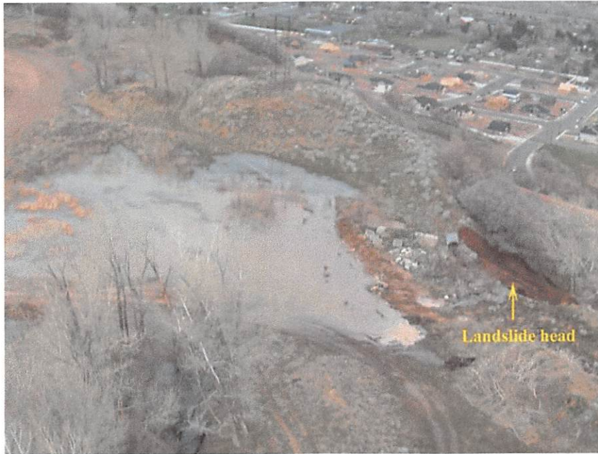
Figure 5. View looking northwest at the pond in the gravel pit and the landslide head (arrow). A berm was placed between the pond and the landslide to prevent water from flowing onto the landslide. Photo taken on the morning of April 10, 2005, by Davis County Sheriff's Office personnel.