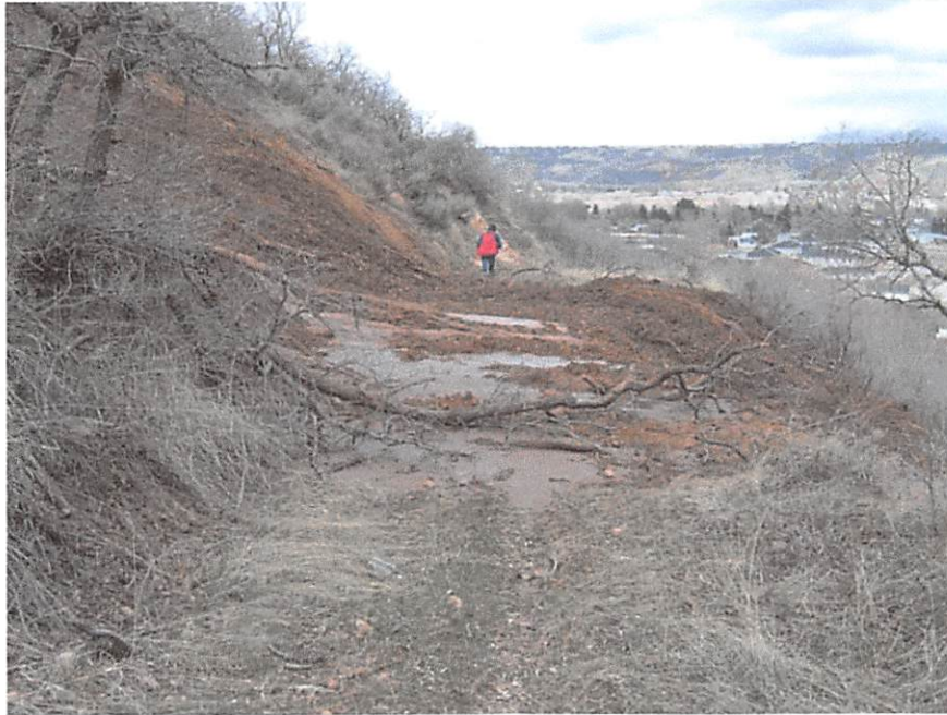
Figure 10. Landslide material deposited on a dirt road midslope above the Davis-Weber Canal.

the pond (figure 5) also indicate the presence of perennial shallow ground water since surface-water runoff alone would not sustain this vegetation. Cottonwood trees growing along the slope crest also indicate shallow ground water (figure 6). Following the landslide, a soil berm was placed between the pond and the landslide to prevent pond water from flowing onto the landslide head (figure 5).