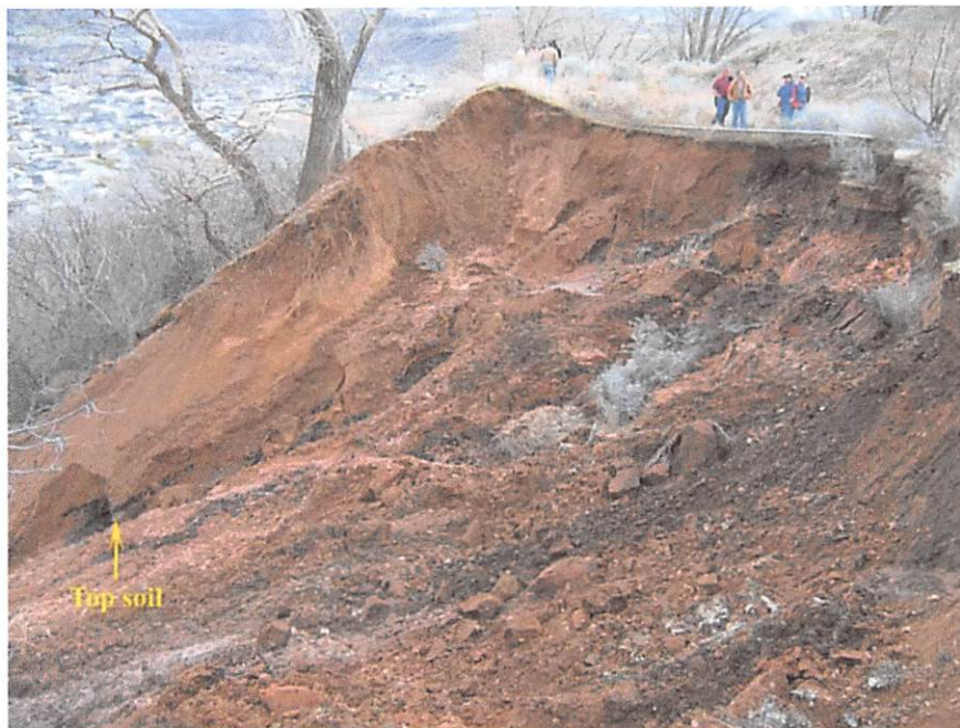
Figure 6. View to the southeast showing landslide main scarp and fill placed on the upper slope. Near the left edge of the photo, black top soil at the base of the scarp (arrow) underlying the brown fill is evident and indicates the original slope surface.