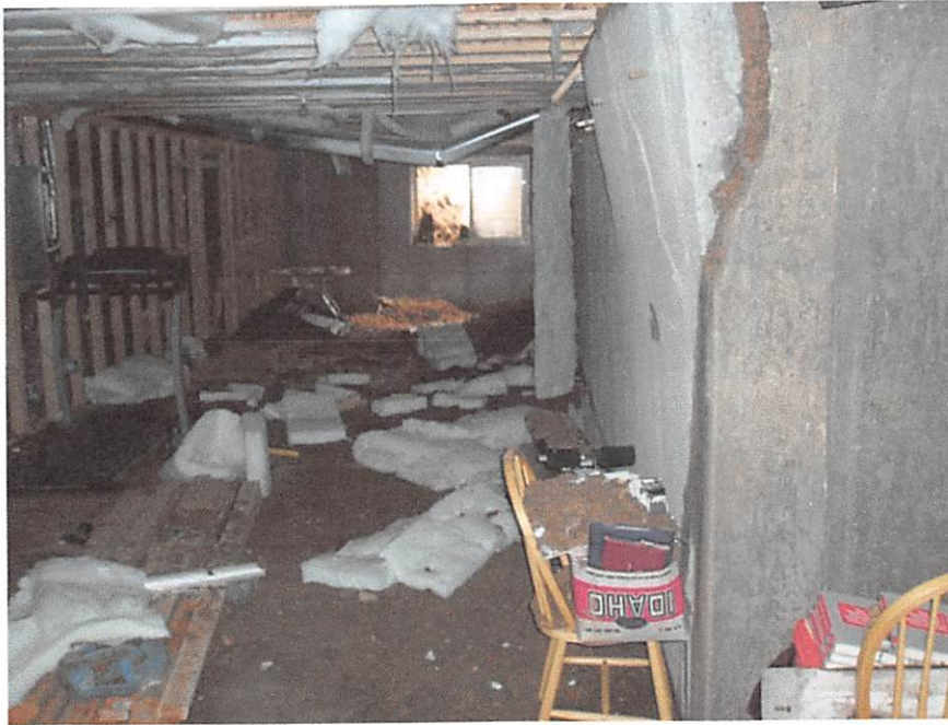
Figure 8. Basement at 1650 East 7687 South showing upper foundation wall (right side of photo) broken by landslide impact.