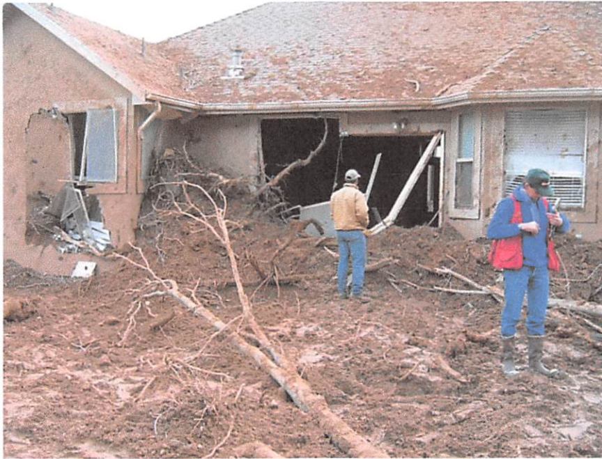
Figure 3. Landslide damage to the house at 1650 East 7687 South.