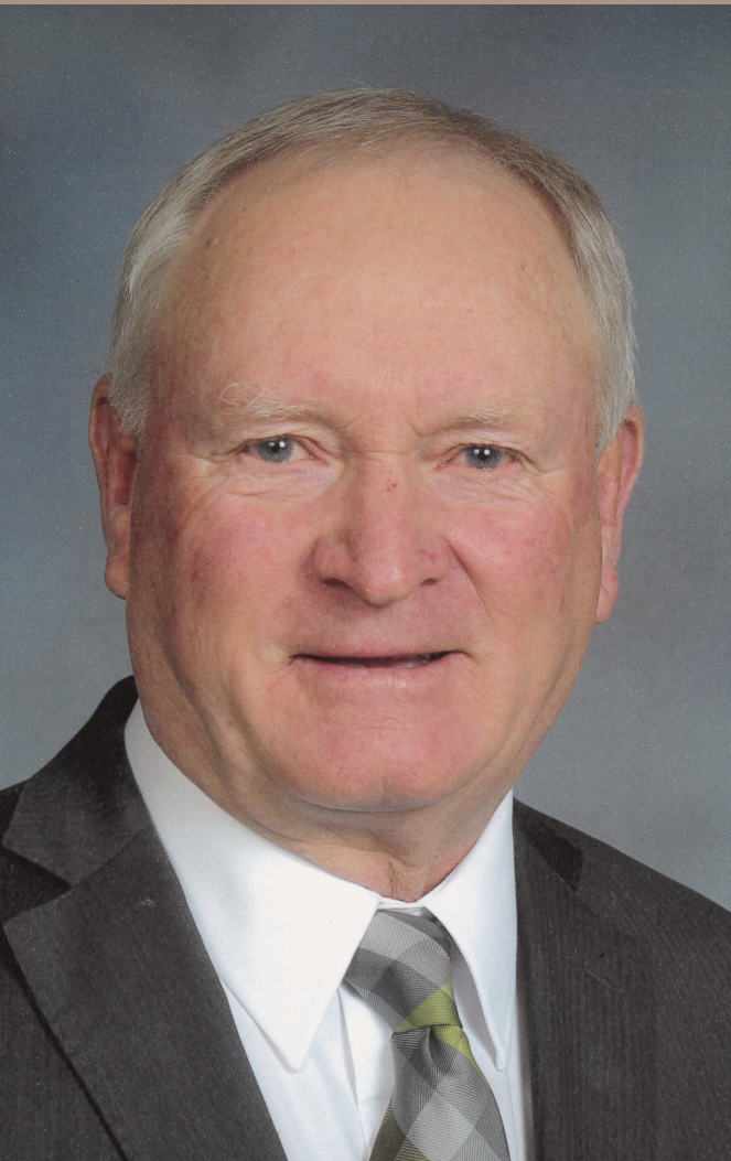
Mayor Rod Westbroek